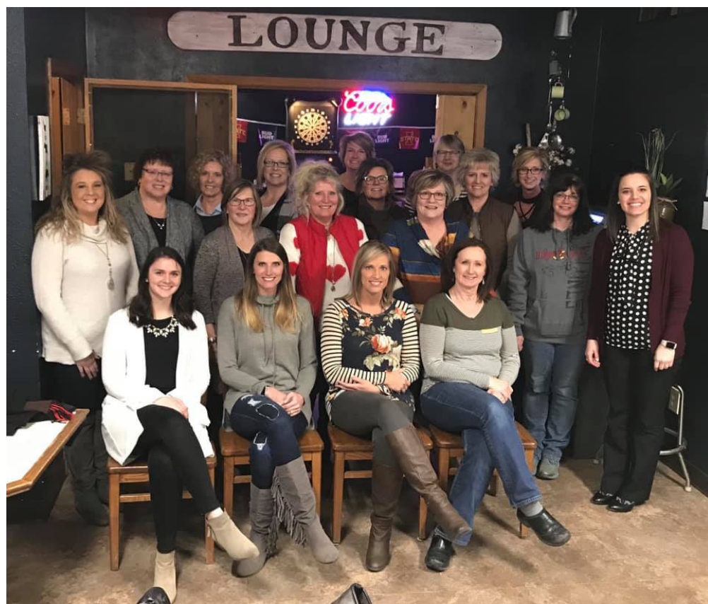
2019 First Quarter Meeting