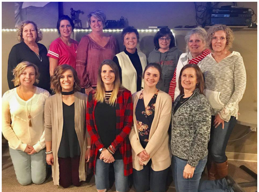
2018 First Quarter Meeting