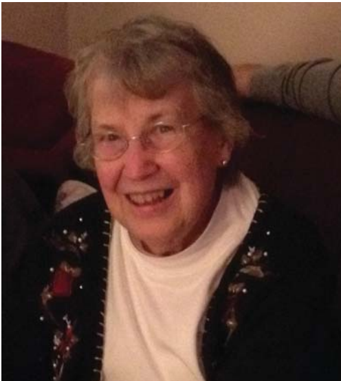
Our Town Our Paper!