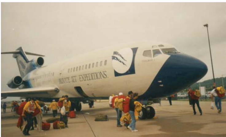
This is a shot of the Charter flight getting ready to leave Ft. Smit, Arkansas. At the time I would have been a County Forester with the Arkansas Forestry Commission. This would have been in 1992 or 1994. In 1992 we flew to Sacramento, California to a fire just south of Yosemite and in 1994 we flew to Salt Lake City, Utah headed for two fires, the first in Malad, Idaho on the Utah/Idaho border and the second fire at McCall, Idaho north of Boise, Idaho.