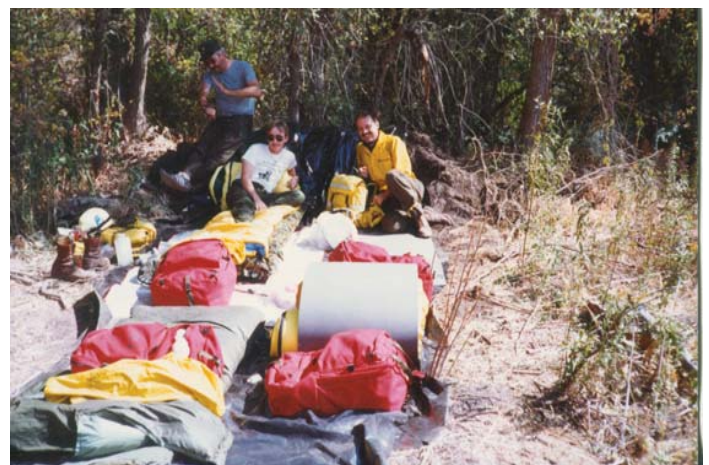
On my first fire in 1988. I was on a pick up team with the national Park Service out of Hot Springs, Arkansas.