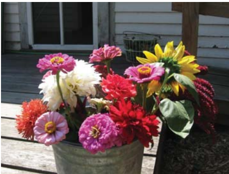
Fresh flowers and vegetables bring the farmhouse porch to life.

We trust the Wiegert Prairie Farmstead will continue to reach a new generation and remain a quiet place where each of us may step back in time and reflect upon the legacy we have received, the legacy we will bequeath.