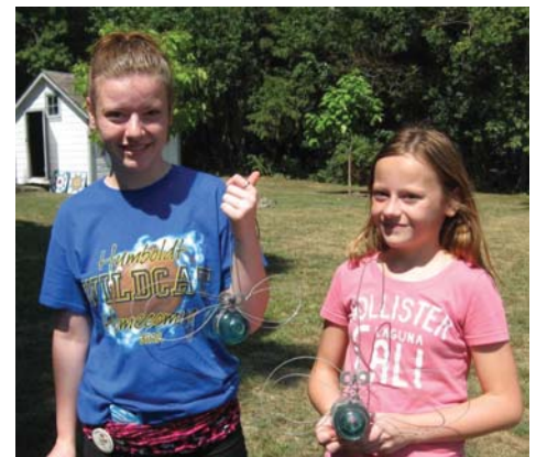
A new generation enjoys Wiegert Fall Fest.