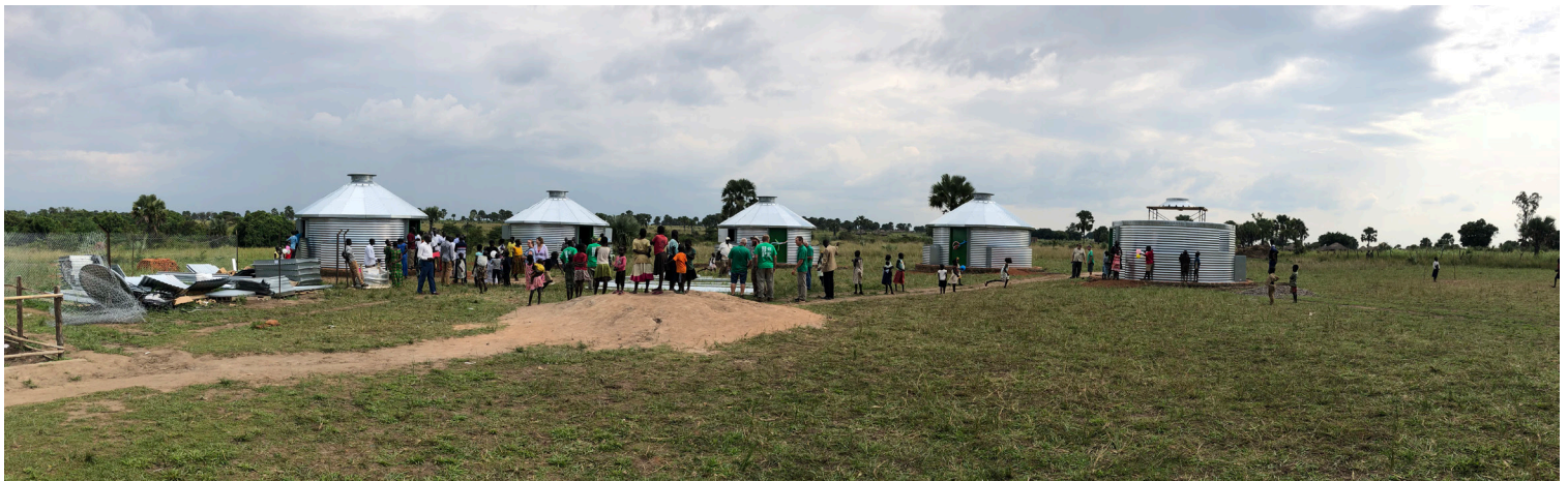
A GoServ Global team working with local Ugandans to build the fifth Safe T Home in Gulu, Uganda, to house refugee children who have fled from war-torn South Sudan.