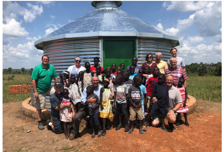
A GoServ Global team in front of a newly-built Safe T Home in Gulu, Uganda, with a few of the refugee children who will live there.

heal from damage to property and spirit. Internationally, GoServ Global responds to emergency situations then identifies opportunities to create lasting solutions for long-term humanitarian needs. See more about ongoing projects in Haiti, Peru, India, Guatemala, Uganda, and the U.S. by visiting goservglobal.org .