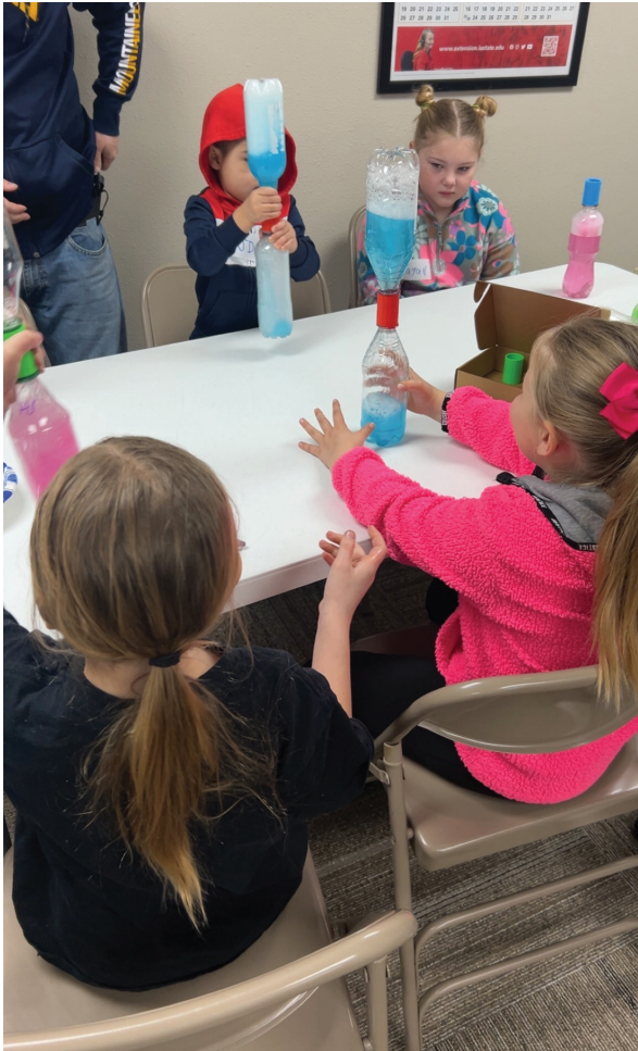
Biggest Little Paper In Town!