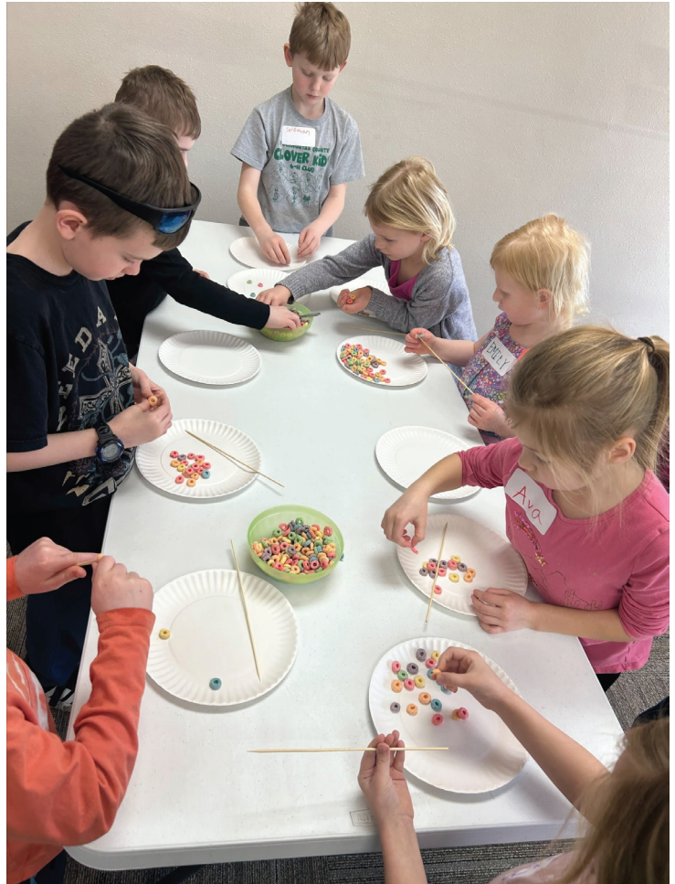
Clover Kid members creating tornadoes in a bottle and rainbow snack.